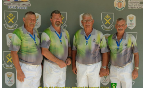
DIVISION A: 2ND KWAZULU-NATAL