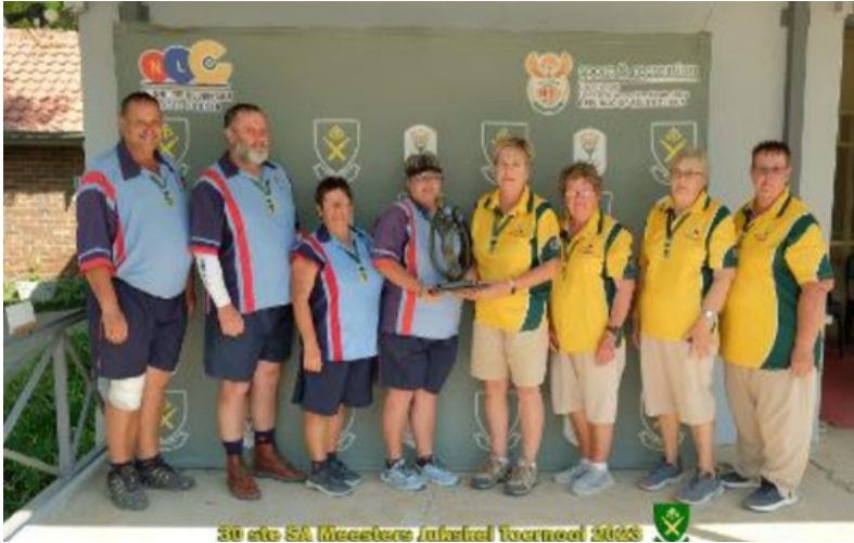
DIVISION E: 1ST GAUTENG NORTH & NORTHERN FREESTATE