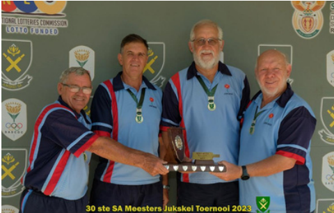
DIVISION A: 1ST GAUTENG NORTH