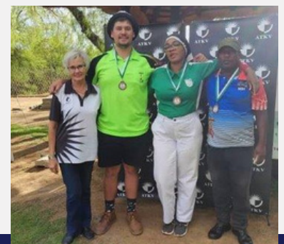
C-DIVISION 3RD PLACE