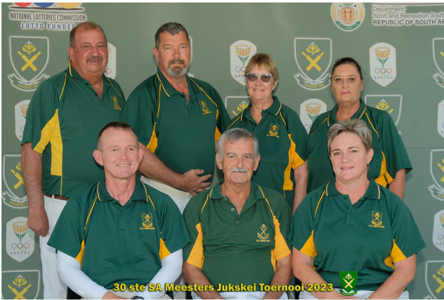
PRESIDENTS TEAM 2023