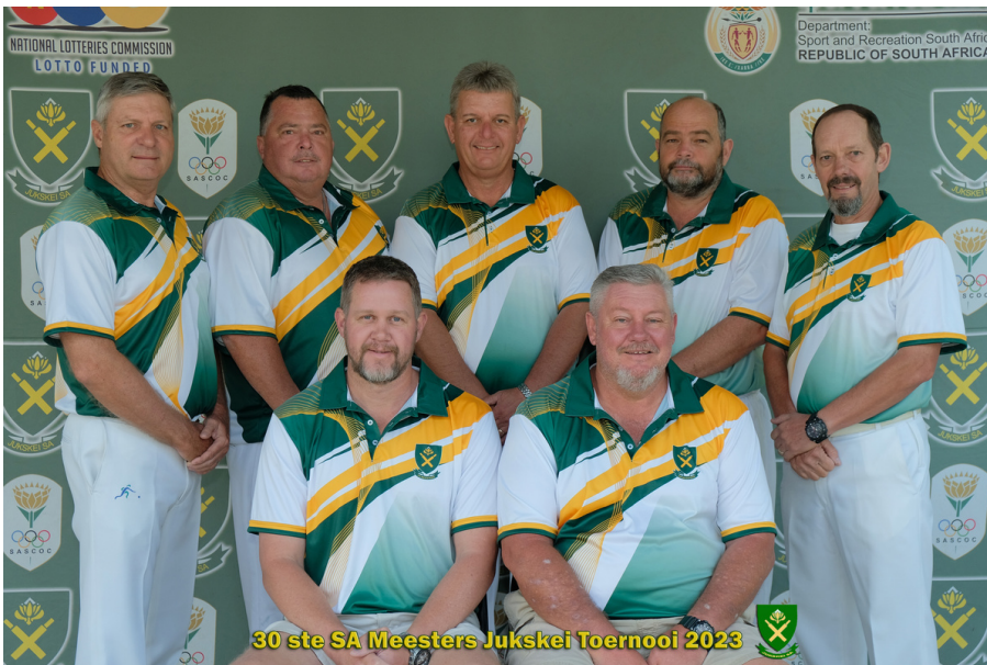
MASTERS MEN 2023