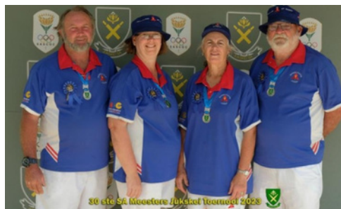
DIVISION C: 2ND WP