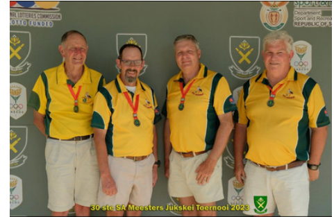
DIVISION A: 3RD NORTHERN FREESTATE