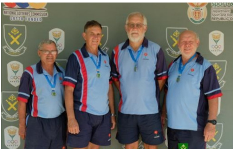
Division A: 2nd Gauteng North