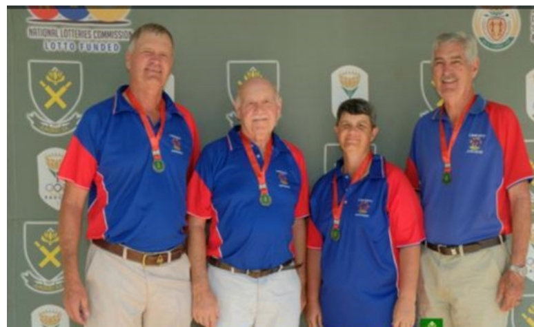
Division A: 3rd Limpopo