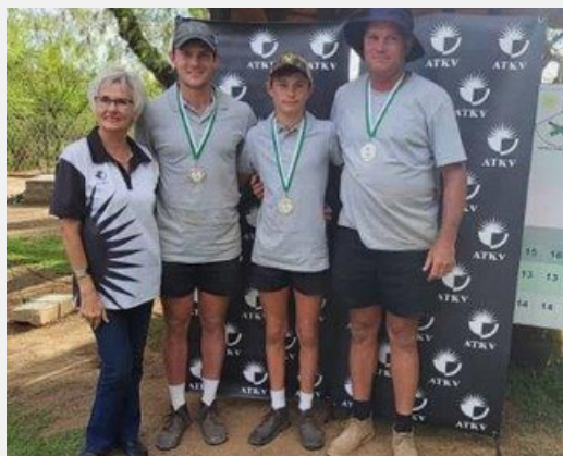
B-DIVISION 2ND PLACE