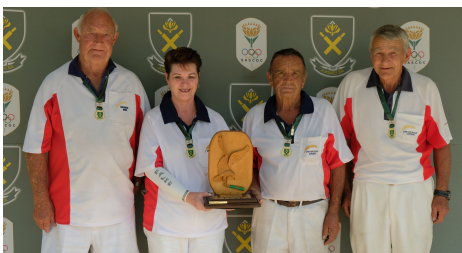
DIVISION C: 1ST EASTERN FREESTATE