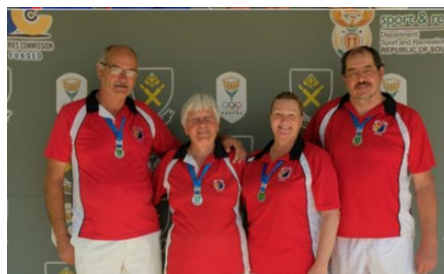
DIVISION D: 2ND OVERBERG