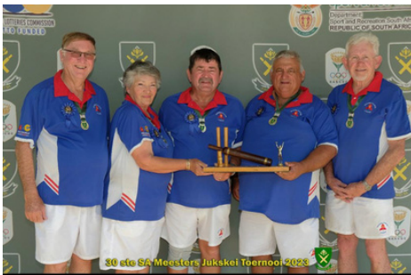
DIVISION B: 1ST WP