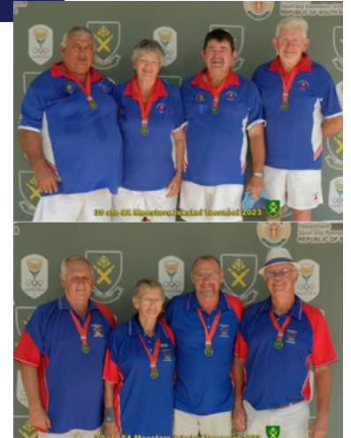
DIVISION B: 3RD WP & LIMPOPO