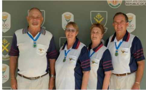
DIVISION B: 2ND SOUTHERN FREESTATE