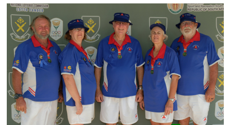
DIVISION C: 3RD WP