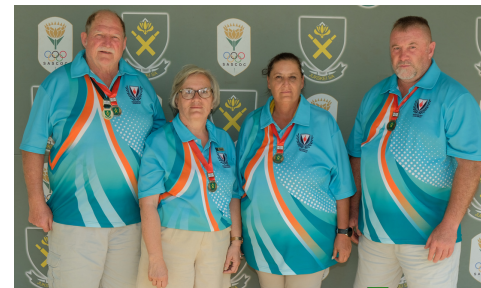
DIVISION D: 3RD SEDIBENG