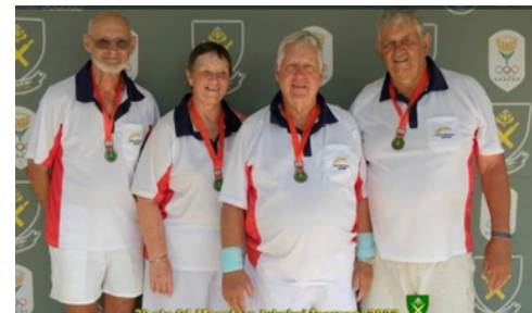
DIVISION E: 3RD EASTERN FREESTATE