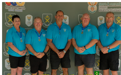
DIVISION C: 2ND WESKUS