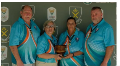
DIVISION D: 1ST SEDIBENG