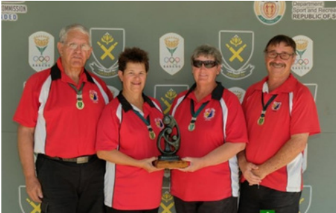
DIVISION B: 1ST OVERBERG