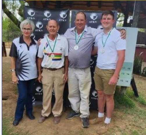
A-DIVISION 2ND PLACE