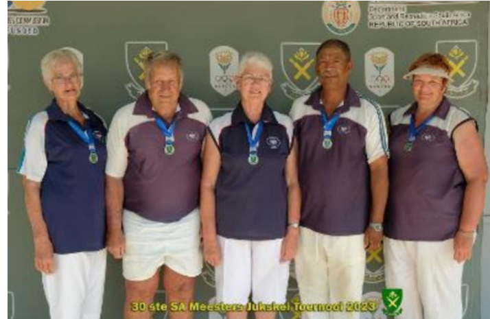
DIVISION E: 2ND NORTHERN CAPE