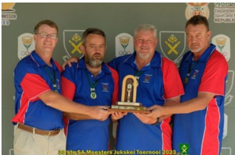
DIVISION C: 1ST LIMPOPO