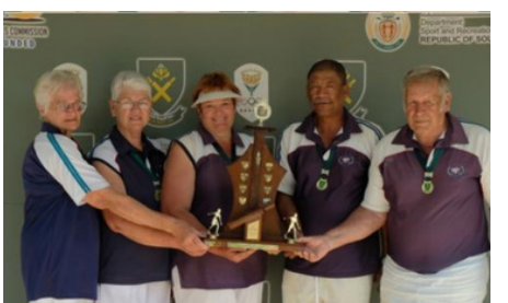
DIVISION E: 1ST NORTHERN CAPE