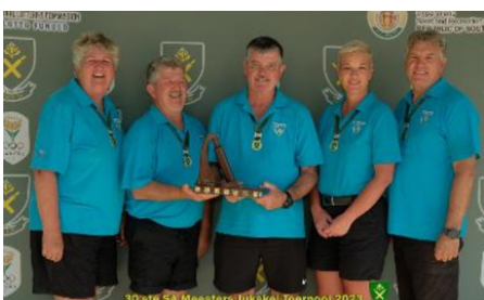
DIVISION D: 1ST WESKUS