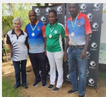
C-DIVISION 2ND PLACE