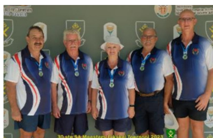
DIVISION D: 2ND EASTERN GAUTENG