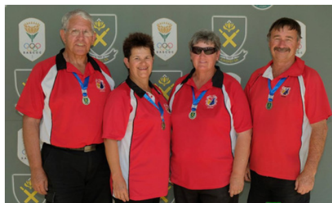
DIVISION B: 2ND OVERBERG