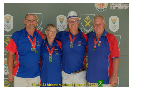
DIVISION B: 3RD LIMPOPO