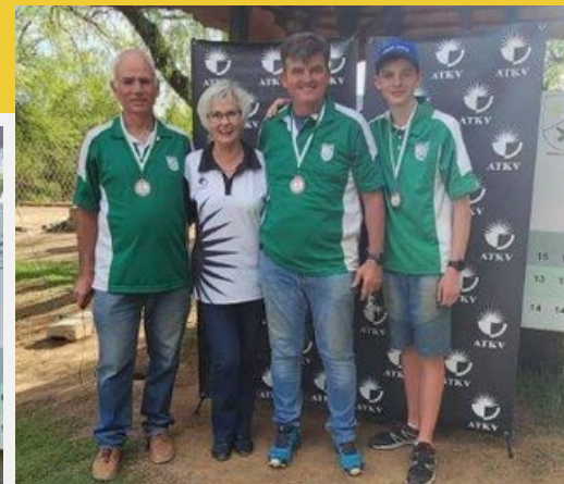
B-DIVISION 3RD PLACE