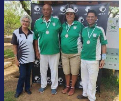
A-DIVISION 3RD PLACE