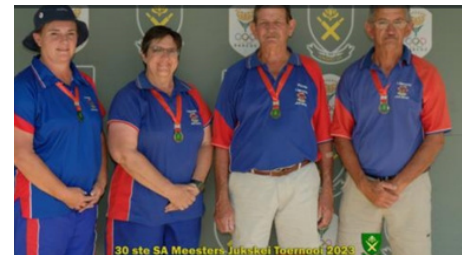
DIVISION D: 3RD LIMPOPO