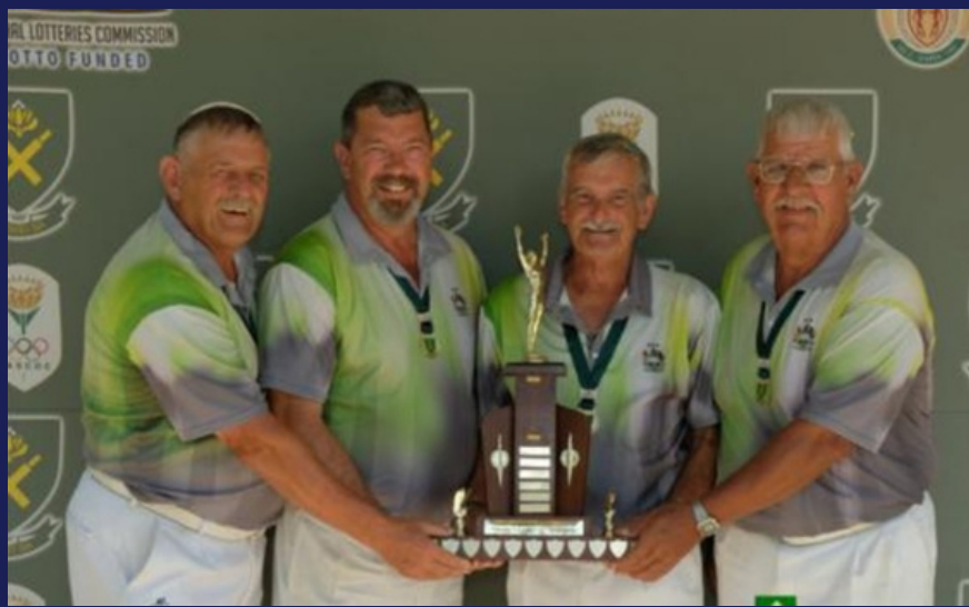
Division A: 1st KwaZulu-Natal