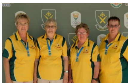
DIVISION E: 2ND NORTHERN FREESTATE