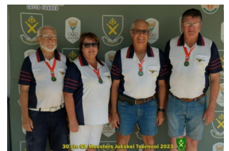
DIVISION C: 3RD SOUTHERN FREESTATE